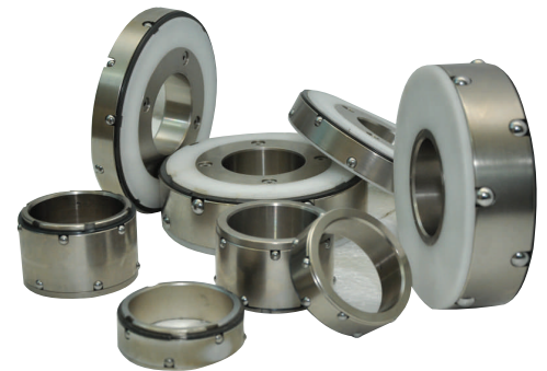
BALL TYPE QUICK LOCKS